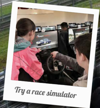
Try a race simulator