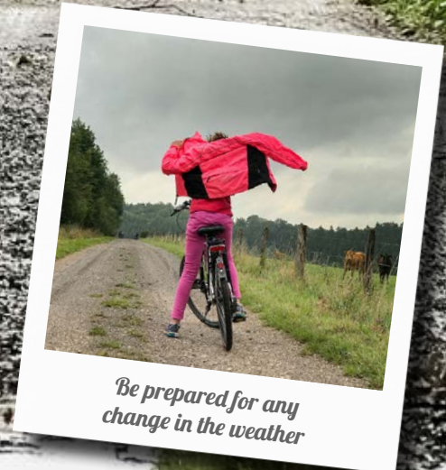
Be prepared for any change in the weather