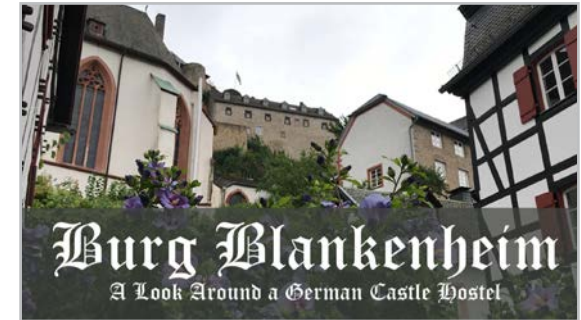
Watch the video - click to play

The main hostel building is light and airy and its walls are studded with interesting objects and images. The pleasant eating area serves a free buffet breakfast and meals are available on request. We enjoyed filling breakfasts and a picnic style tea with plenty of good bread, ham and cheese.