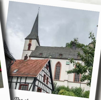
The church of St. Mariä