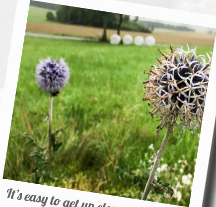
It's easy to get up close with nature around the Eifel National Park