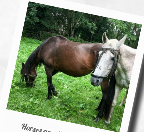
Horses grazing in the Eifel

If you want to see local wildlife up close, visit the Eifel Wildlife Park . It has 200 animals including bears, wolves and lynx, as well as a falconry experience, live shows, rollercoasters and rides.