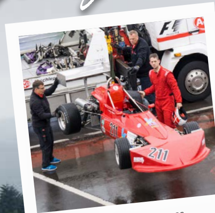
Unloading for a race at Old Timer Rally

A visit to the Eifel region might be an escape from the hustle and bustle of the city but it's not all peace and quiet and natural pursuits. Around 40km from Burg Blankenheim Hostel is one of world's best Formula One circuits; the Nürburgring . When we visited there was a huge classic car rally at the track, which is situated in the town of Nürburg. The Nürburg Old Timer rally was a colourful riot of cars and drivers, all racing noisily for trophies. And at the end of the event there was a fun parade of slick, shiny and no doubt very expensive classic cars.