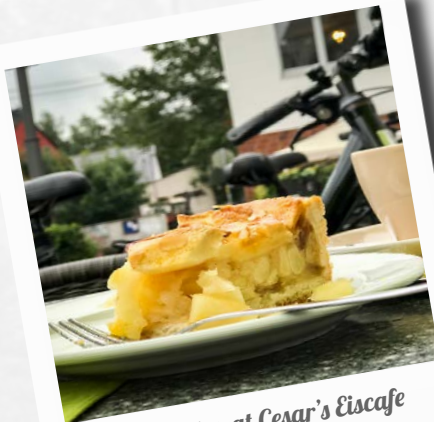
Strudel stop at Cesar's Eiscafe in Nettersheim

In the nearby village of Nettersheim, we discover Cesars Eiscafe Serafin , one of a family run chain of cafes. We then discover another branch in Blankenheim. The family has been producing gelato from Italian family recipes for more than fifty years, but we manage to consume five After Eight ice cream based milkshakes in about 50 seconds, so in my opinion we won. (The Formula One racing experience clearly rubbed off!)