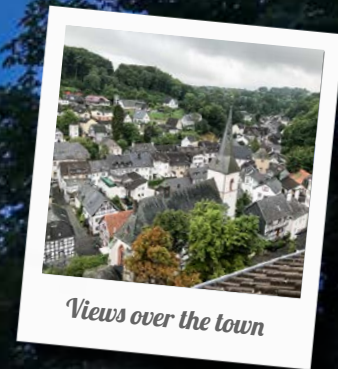
Views over the town