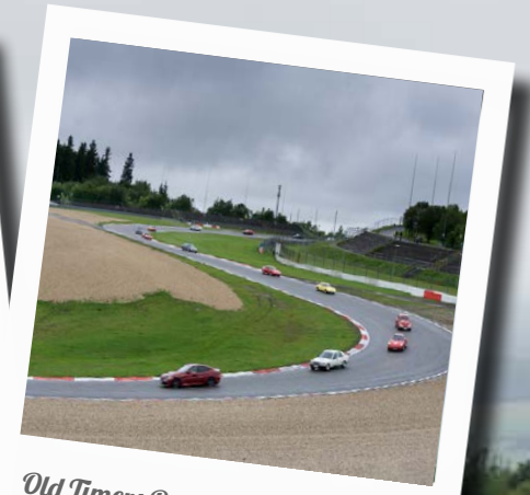
Old Timers Parade at Nürburgring

The 20.832 km North Loop (Nordschleife), winds around Nürburg village and medieval castle and has more than 300 metres of elevation change – it was so lethal that Jackie Stewart nicknamed it “The Green Hell.” These days, races happen on a newer track, the infamous 5.148km Grand Prix track.