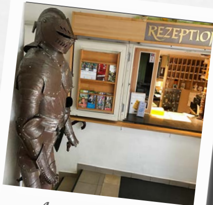
A warm welcome from a knight in armour