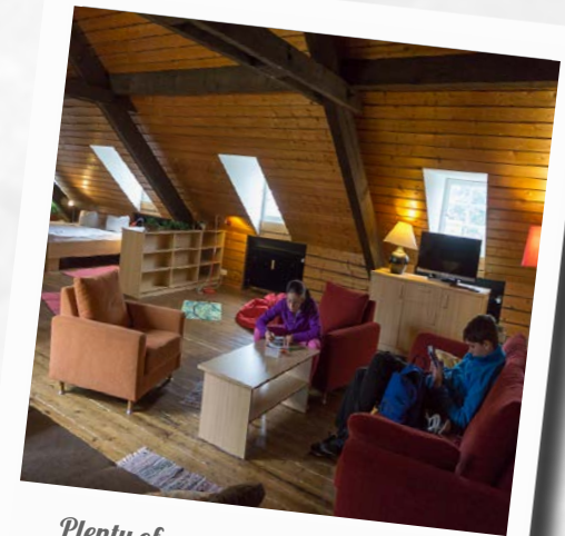
Plenty of room to relax in one of the family rooms in the Bastionhaus