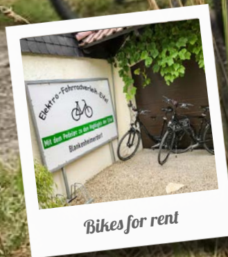
Bikes for rent

Our journey took us through wooded beech forest, past tufted fields and along flat gravel tracks. We said hello to the cattle, stopped to watch a train go by, and accidentally ended up biking through a meadow. At the half way mark there was a convenient refreshment stop in Nettersheim. Coffee, apple strudel and ice creams provided enough fuel to get us back to Blankenheim.