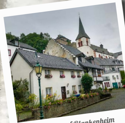
The centre of Blankenheim is very picturesque

After a few minutes peering in through the bars and smelling the damp we decided a warm up was in order and headed to Beros Grillhouse and Pizzeria in town for pizza, which we doused in another kind of sauce.