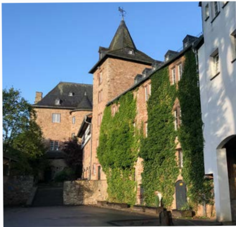
The main hostel building of Burg Blankenheim