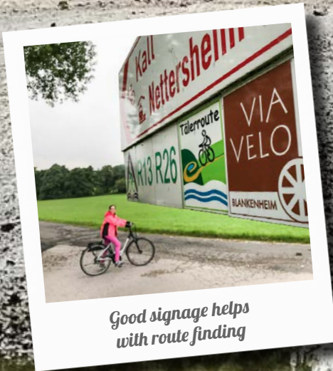
Good signage helps with route finding

If you still have energy after a long route, there are plenty of shorter mountain bike trails to try. Check out the mountain bike routes of the Eifel Free Rides or Bad Münstereifel . For families who just want a taster with gentle gradients, there's an easy non circular route called the Eifel Radweg , following old railway lines.