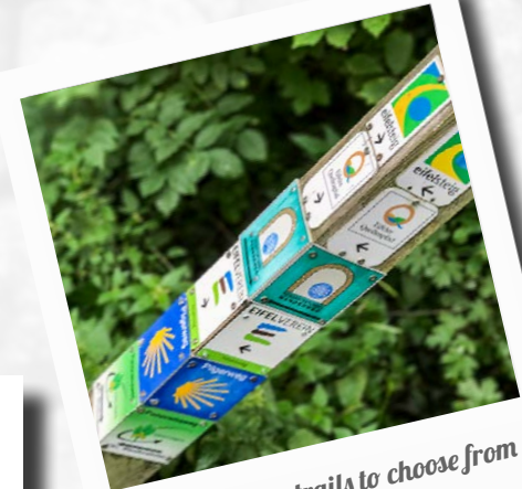
Lots of hiking trails to choose from

If you get tired of flower spotting you could always try bug hunting. On a previous visit to the Eifel a ranger told me there are more than 1,300 species of beetle in the park.