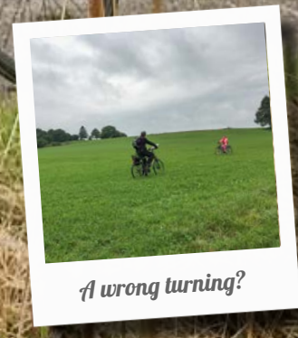
A wrong turning?